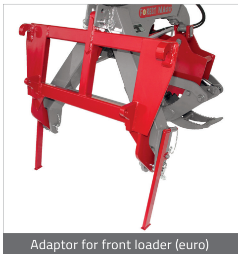
Adaptor for front loader (euro)

> Tractor with double effect valve required