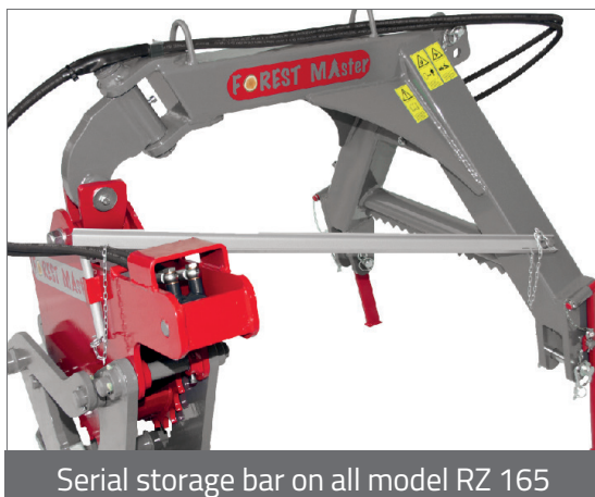
Serial storage bar on all model RZ 165