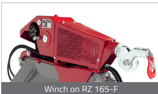
Winch on RZ 165-F