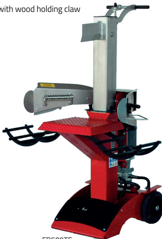
FB509TF with fixed table and 2 removable baskets