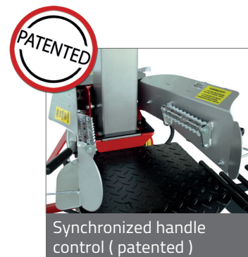
Synchronized handle control ( patented )