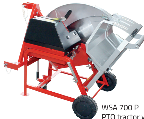
WSA 700 P PTO tractor with belt drive