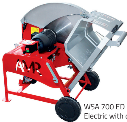
WSA 700 ED Electric with direct drive