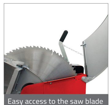
Easy access to the saw blade