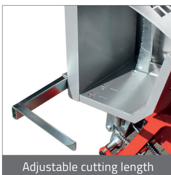
Adjustable cutting length