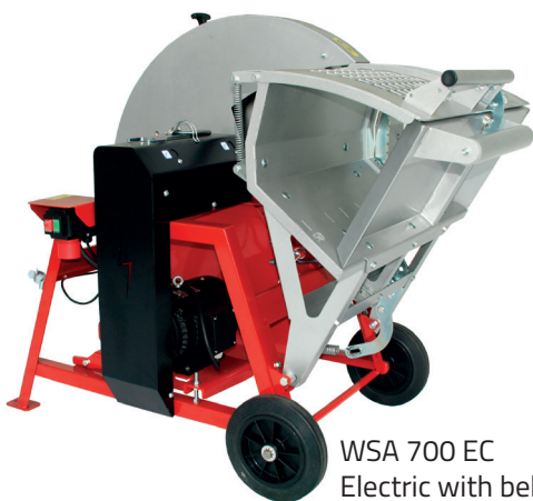
WSA 700 EC Electric with belt drive