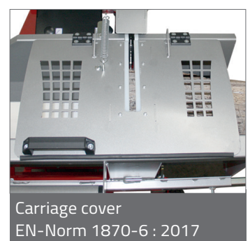
Carriage cover EN-Norm 1870-6 : 2017