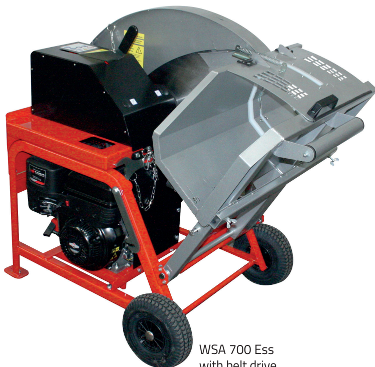
WSA 700 Ess with belt drive