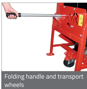
Folding handle and transport wheels