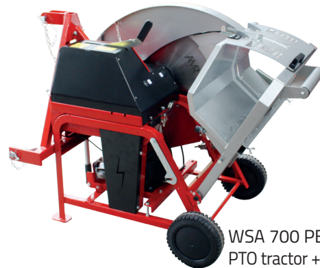
WSA 700 PE PTO tractor + Electric with belt drive