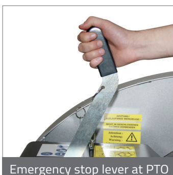
Emergency stop lever at PTO