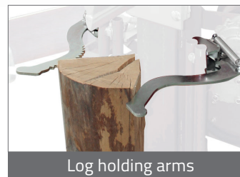
Log holding arms