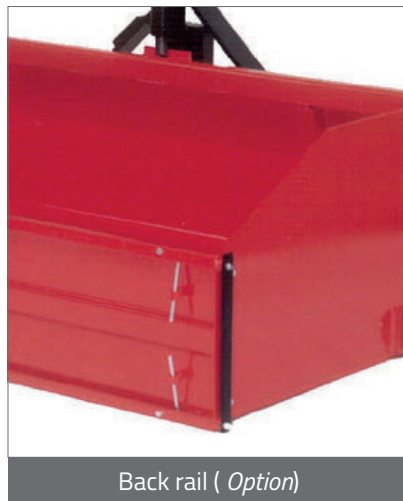
Back rail ( Option)

Specific articulation point of tilting system, making linkage more resistant