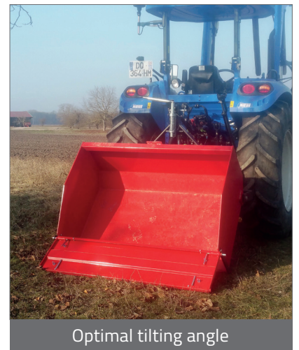
Optimal tilting angle